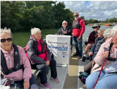
River Hamble Boat Trip