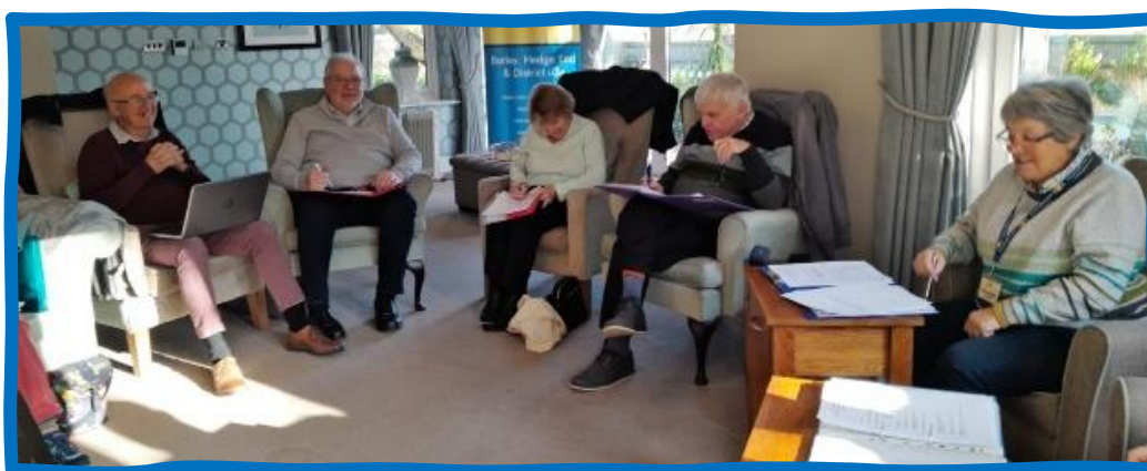
The committee in action!

If you have a skill which would help the group or are interested in joining the committee, please speak to us at any members meeting. You can also text on 07865 825380 or email us via the Botley, Hedge End and District website enquiries page .